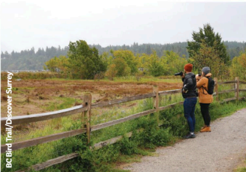
BC Bird Trail/Discover Surrey